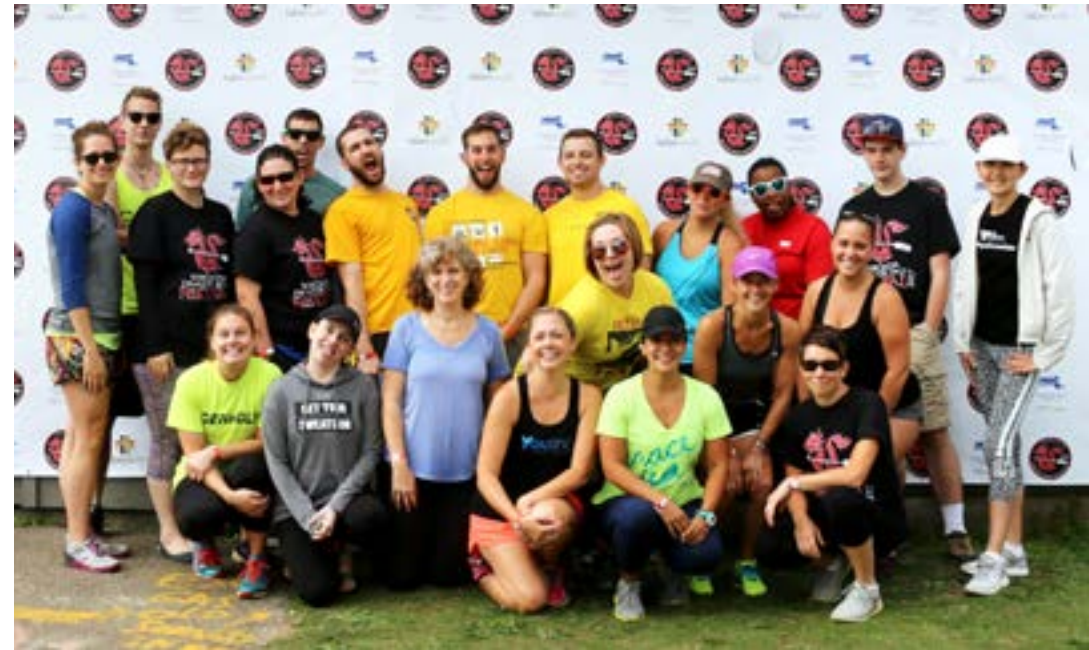
YOU, Inc. staff pose for their official team photograph before rowing the Worcester Railers HC sponsored boat at the inaugural Worcester Dragon Boat Festival

Creedon & Co. Curry Printing Pagano Media S&S Deli & Farms Wachusett Mountain Worcester Business Journal